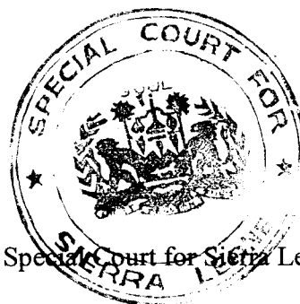
Seal of the Special Court for Sierra Leone