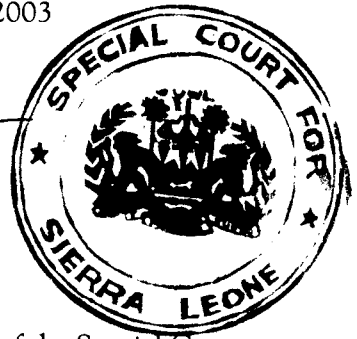
Seal of the Special Court