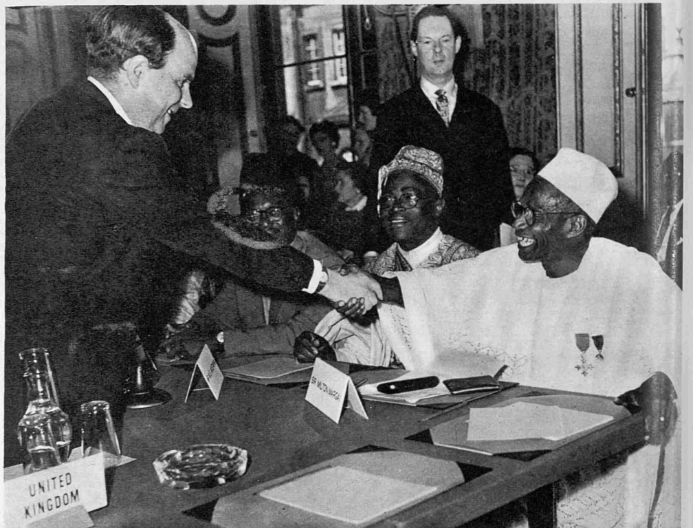
THE CHAIRMAN OF THE CONFERENCE AND THE LEADER OF THE SIERRA LEONE DELEGATION: Before the proceedings start in Lancaster House, Mr. Macleod shakes hands with Sir Milton Margai, the Prime Minister of Sierra Leone. It was understood the Sierra Leonians were asking that December 7 should be the day on which they become independent within the Commonwealth.

A Conference in London to Decide the Date for "Independence Day"