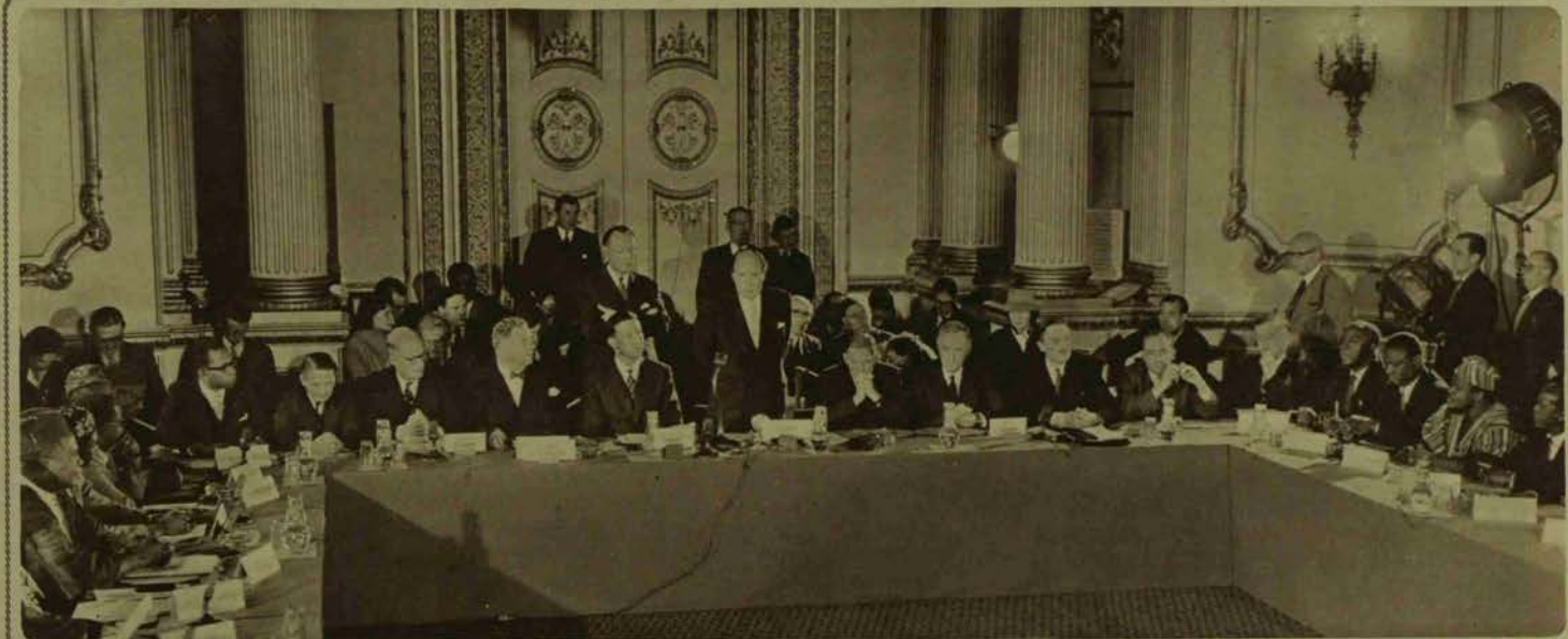
AT THE CONSTITUTIONAL CONFERENCE WHICH CONFERRED INDEPENDENCE ON SIERRA LEONE FROM APRIL NEXT YEAR: MR. MACLEOD SPEAKING. Sir Milton Margai, Prime Minister of Sierra Leone, said he was restrained from dancing for joy only by the presence of the Secretary for Colonial Affairs, Mr. Macleod, when the announcement was made that Sierra Leone would become independent. The Conference at Lancaster House ended on May 4.