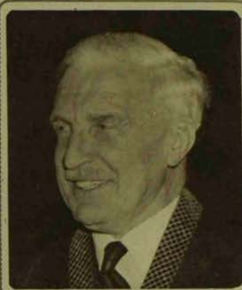
PRESIDENT OF THE SOVIET PRAESIDIUM: MR. LEONID BREZHNEV.

Marshal Voroshilov has been succeeded by Mr. Brezhnev, who is fifty-three, as President of the Praesidium of the Supreme Soviet. It was reported that Marshal Voroshilov retired on the grounds of ill-health. The new President was elected deputy of the Supreme Soviet in 1954 and, in August 1955, first secretary of the Kazakh Central Committee.